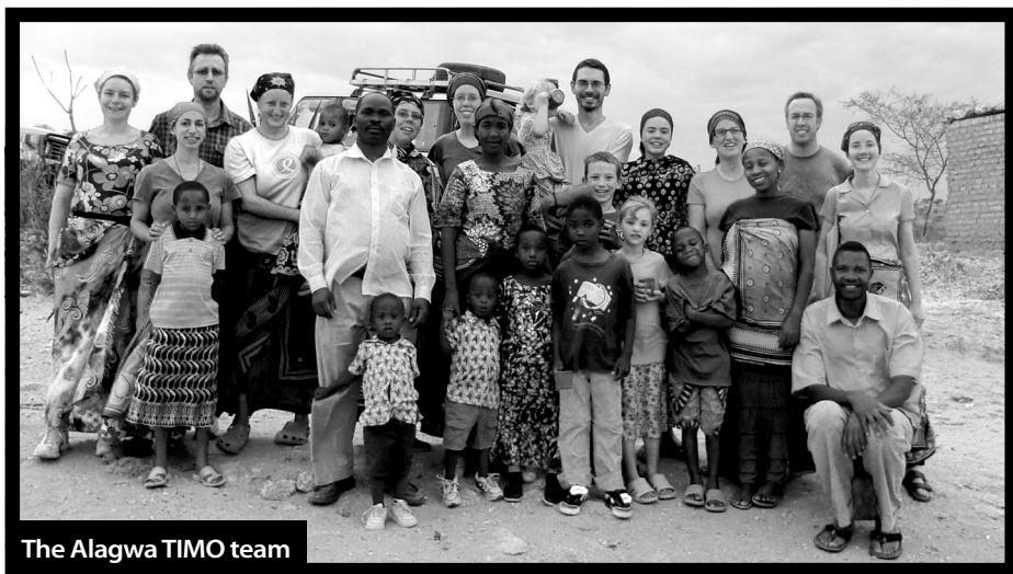
The Alagwa TIMO team