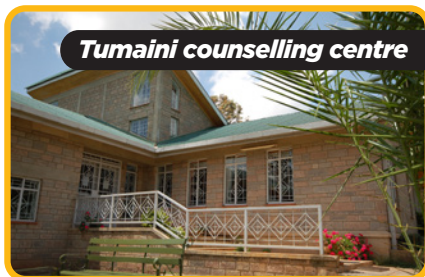
Tumaini counselling centre

Missionary life can be lonely, difficult, and hold disappointment. Providing appropriate support and help for missionaries on the field is very important. Today we'll pass by AIM's counselling centre, Tumaini (a Swahili word meaning 'hope'). Pause to pray for both the missionaries serving as counsellors and for those who are using their services.