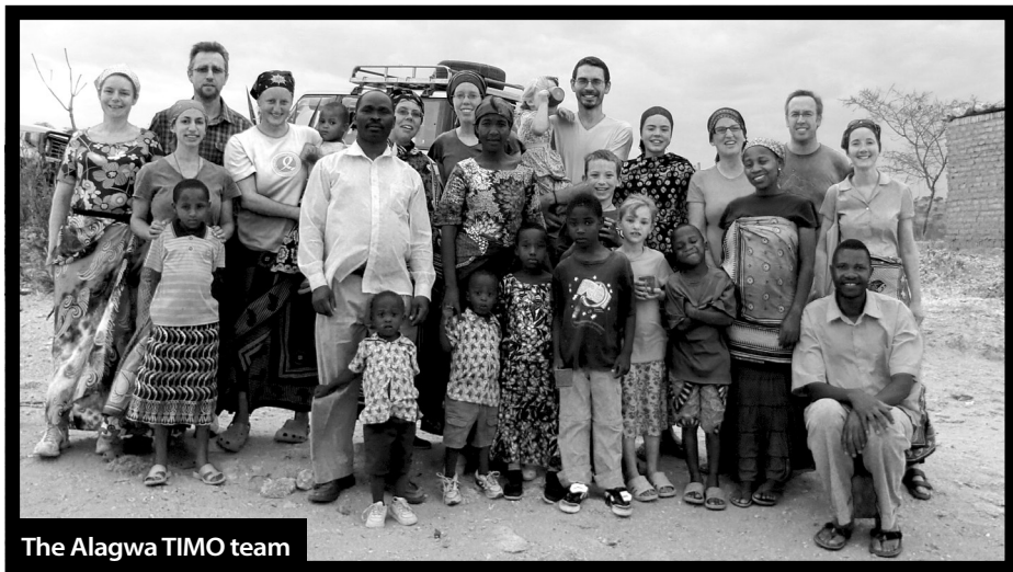
The Alagwa TIMO team